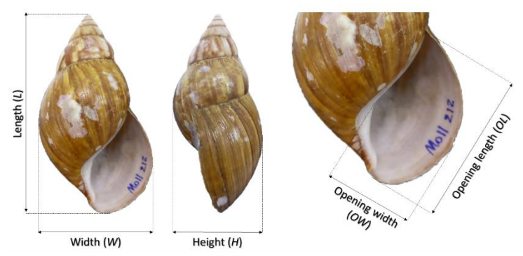
Figure 3 – Shell of Achatina fulica (MZUFRA Moll 212), with indication of the morphometric measurements used. Sample available in the collection of the Malacological Collection of the Zoology Museum of the Federal Rural University of the Amazon (MZUFRA), Source: Santos et al. (2020).