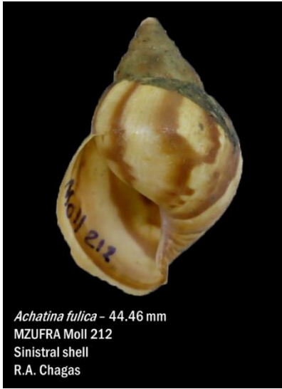
Figure 1 – Achatina fulica sinistral shell used in this study and available for consultation at the Malacological Collection of the Zoology Museum of the Federal Rural

University of the Amazon (MZUFRA).